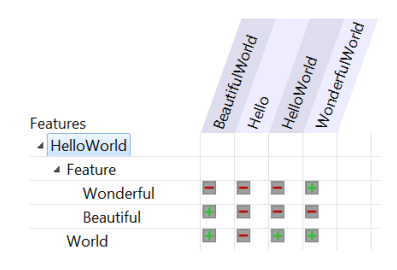
Figure 2: Configuration map for a Hello-World example from FeatureIDE.

Task We ask for solutions that describe how a feature model can be derived from the source code of cloned variants. Consequently, the applied process and its single steps should be reported. Finally,